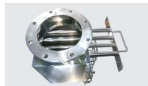
多层抽屉式 Multilayers Magnetic Drawer