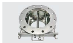
单层抽屉式 Single Layer Magnetic Drawer