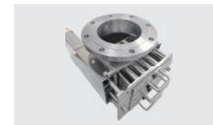
气动自清洁 Pneumatic Self Cleaning