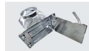
双层带门密封 Double Layers with Door