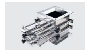
3层抽屉式 3-Layers Drawer Type