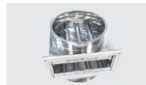
双层抽屉式 Double Layers Drawer