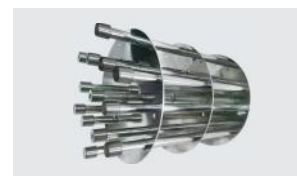
圆形抽拉式 Cylindrical Pulling Type