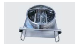
双层易清洁 Double Layers EZY Cleaning