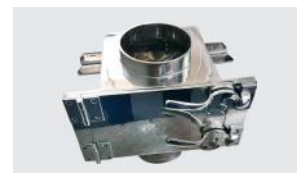
带套管易清洁式 Drawer with Quick Cleaning Tube