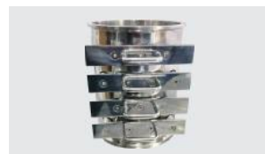
4层抽屉式 4 Layers Magnetic Drawer