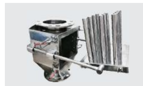
翻转式清洁磁过滤 Turnover Cleaning Drawer Type